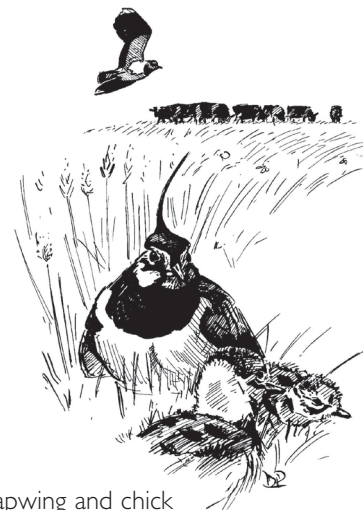
▲ Lapwing and chick